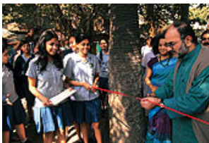
Clear-cut INITIATIVE: Students look on as mayor Bikash Ranjan Bhattacharyya inaugurates the refurbished Victoria Square on Saturday.

If you visited Victoria Square, off Camac Street, before June last year, you would have been greeted with rotting garbage, a foul stench and a large water tank filled with weeds. Now, thanks to the efforts of nearly 250 students from the Nature clubs of five city schools, the 15,000-sq-ft compound has green benches along a newly-made joggers' track, freshly-painted walls and saplings lining the way. The students have also cleaned up the tank around which the compound is constructed.